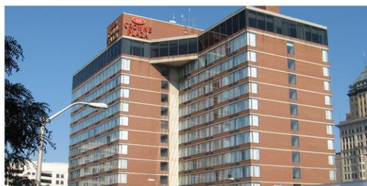
Crowne Plaza Dayton, OH

Please note that Delta Alpha Chapter will not accept credit card information for hotel reservations. Please call the hotel directly using the number listed above or use the link provided on the District Meeting Registration Page for hotel reservations.